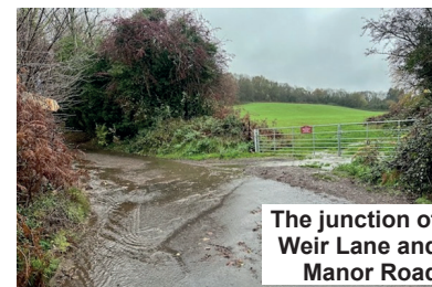
The junction of Weir Lane and Manor Road

Bristol and Clifton Golf has put in a planning application reference 25/P/2595/FUL (see page 6) to create an additional 9-hole golf course and irrigation ponds in the field adjacent to where Weir Lane meets Manor Road.