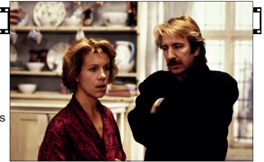
Juliet Stevenson and Alan Rickman

For information: contact angelaprobryn@gmail.com . You are welcome to invite friends and neighbours.